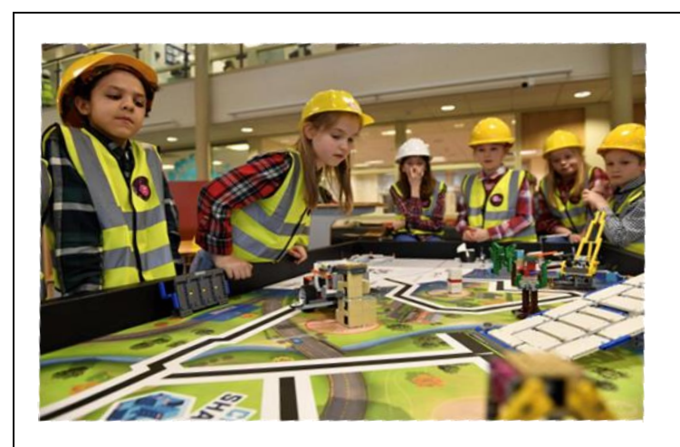
Lego Challenge in Schools